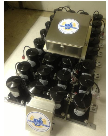
HMS-ATT45K transducers shown in a 4x8 sub-bottom profiler array