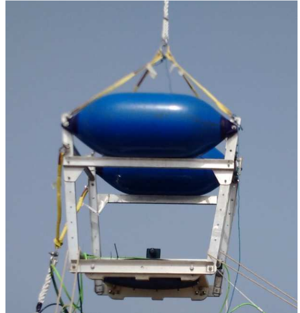
HMS-620LF Low Frequency Bubble Gun™ Source Vehicle