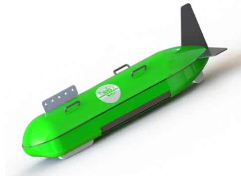
LF and HF Tow Vehicle