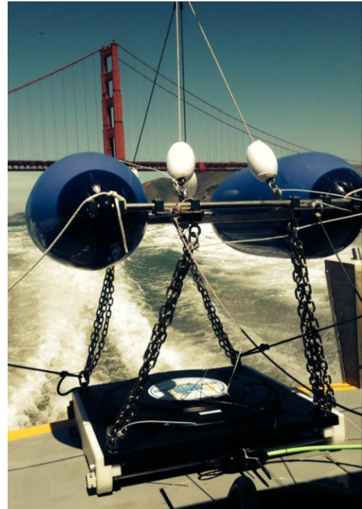
HMS-620LF Low Frequency Bubble Gun™ Source Vehicle