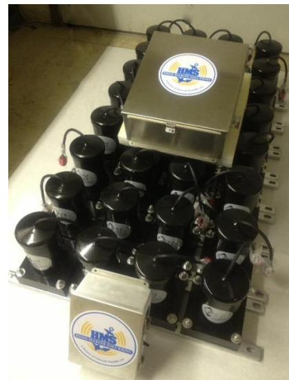
32 Element 12KM LF Array with Preamp and Junction Box