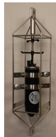
ACM-WAVE-PLUS shown with optional CTD and 5-ton Frame