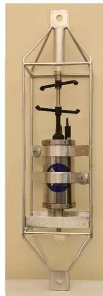
ACM-PLUS-7000 (Deep) Shown with optional CTD and 5-ton Frame