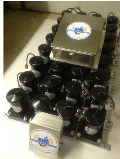
32 Element 12KM LF Array with Preamp and Junction Box