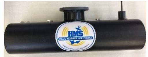
BPA-621HF High Frequency Array