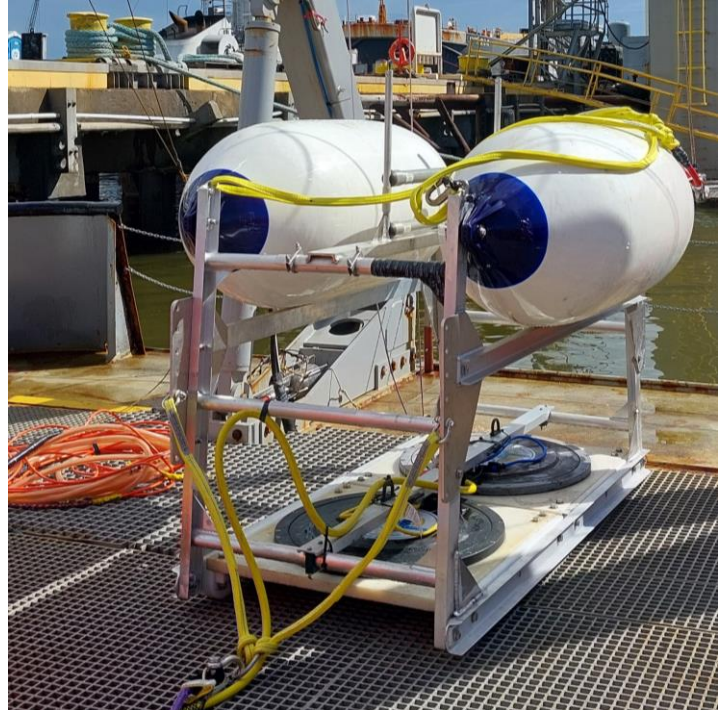
HMS-620LF Dual Low Frequency AquaPulse™ Source Vehicle